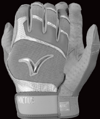
WOLF GRAY | $49.99 ADULT AS - AXXL VBG2-GY

The all new Debut 2.0 Youth Batting gloves are built for those that are born to ball. Featuring signature tech from our adult line and combined with a goatskin palm for added grip.