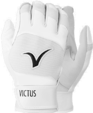
ARCTIC WHITE | $39.99 YOUTH YS - YL VBG2Y-W