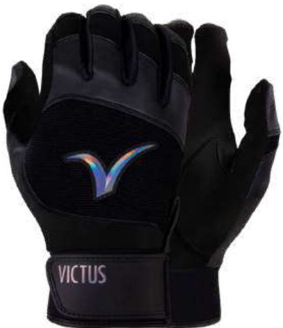
JET BLACK | $39.99 YOUTH YS - YL VBG2Y-BK

The all new Debut 2.0 Youth Batting gloves are built for those that are born to ball. Featuring signature tech from our adult line and combined with a goatskin palm for added grip.