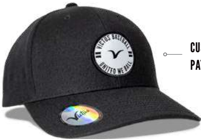
CUSTOM UNITED WE BALL PATCH (WHITE)

UNITED WE BALL HAT | $26.99 ■ BLACK PATCH: VAHTUWB-BK-A ■ WHITE PATCH: VAHTUWB-BK/W-A