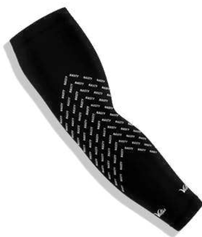
BLACK NASTY SLEEVE | $19.99

Built for ballplayers of all ages, our new compression sleeves are equipped with moisture-wicking tech to keep you dry while you look fly.