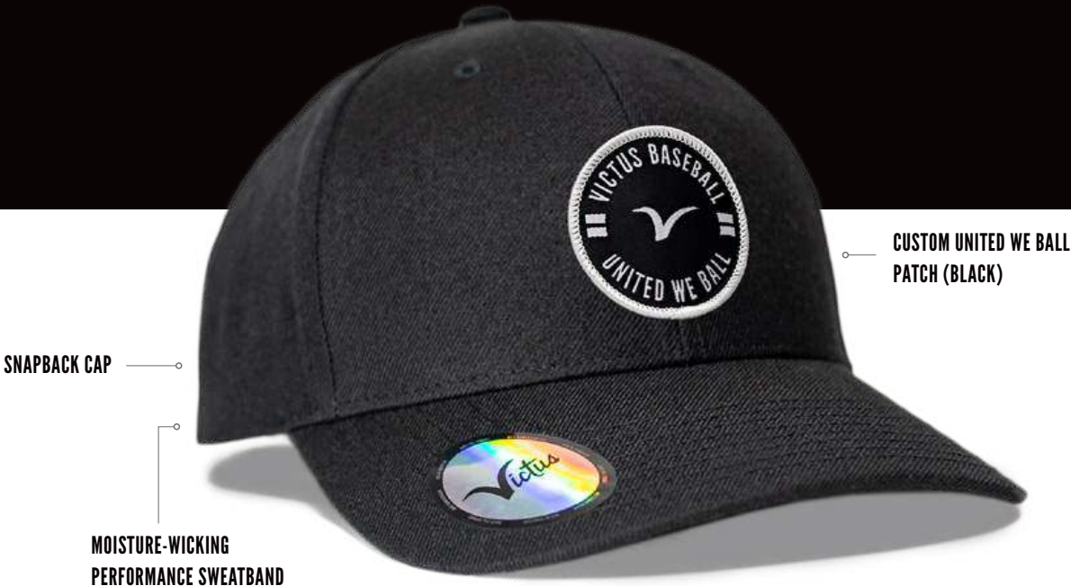
CUSTOM UNITED WE BALL PATCH (BLACK)