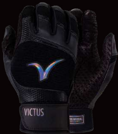
JET BLACK | $49.99 ADULT AS - AXXL VBG2-BK