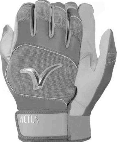
WOLF GRAY | $39.99 YOUTH YS - YL VBG2Y-GY