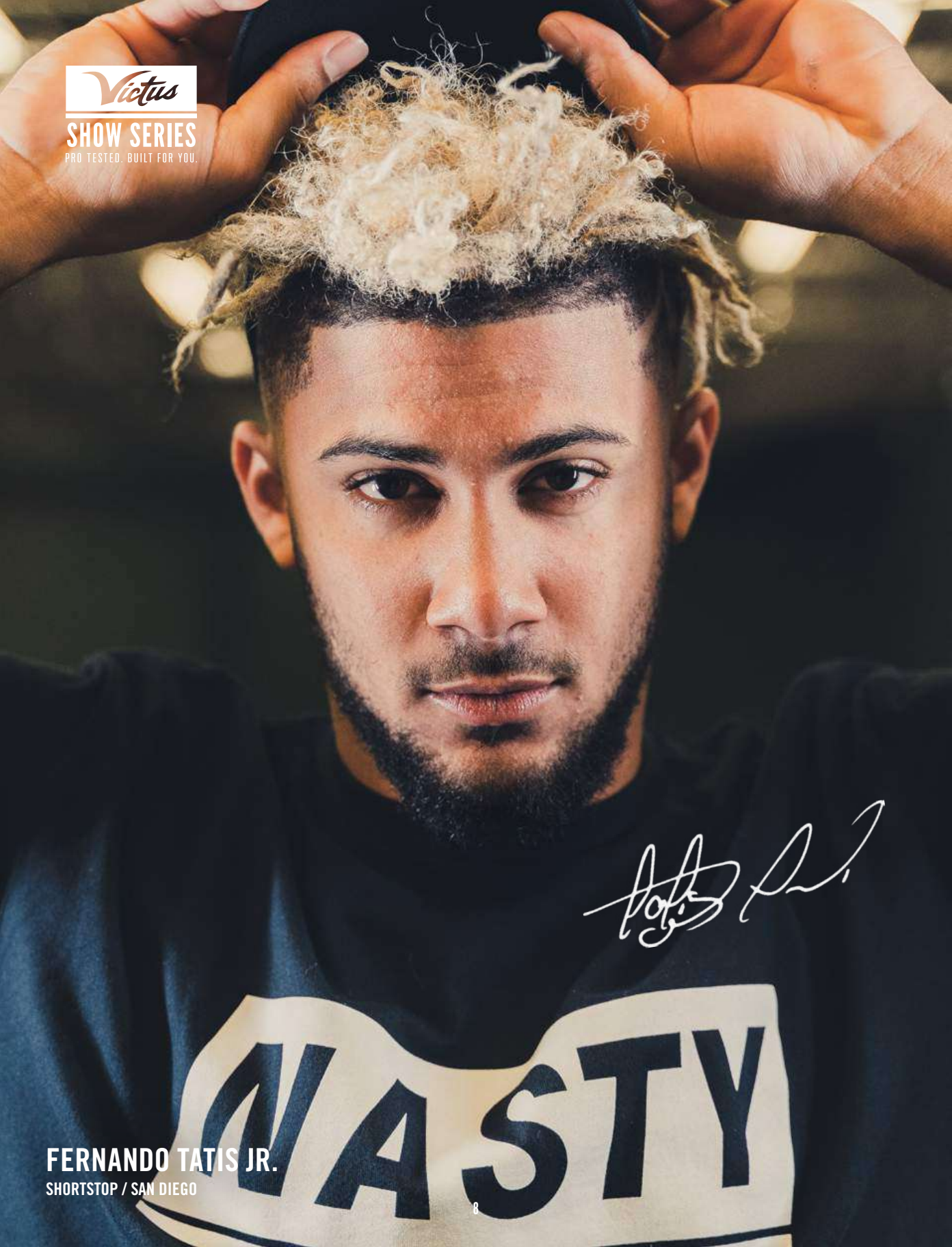
FERNANDO TATIS JR. SHORTSTOP / SAN DIEGO