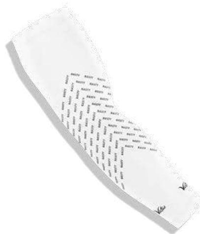
WHITE NASTY SLEEVE | $19.99