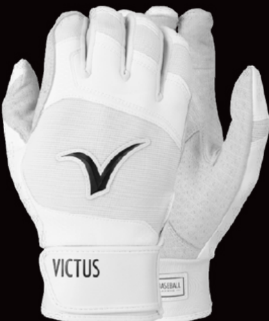
ARCTIC WHITE | $49.99 ADULT AS - AXXL VBG2-W