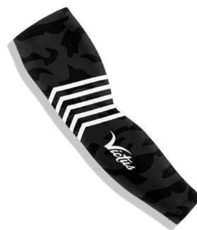
BLACK CAMO SLEEVE | $19.99